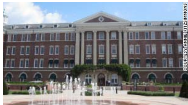
The Culinary Institute of America trains renowned chefs and offers classes for home cooks.

Visiting the Mirbeau Inn and Spa feels like you're visiting the grand country estate of a rich uncle, with fine dining and a spa that rivals those of Manhattan's hotels. For a top dinner choice, Rosalie's Cucina has a reputation that goes beyond the Finger Lakes and is evocative of a bustling Tuscan trattoria. The restaurant, serving heaping plates of salad and pasta, has welcomed A-list guests alongside its local clientele and visitors. You'll see a long line at Doug's Fish Fry , but it moves fast, offering fresh, delicious seafood perfect for lunch.